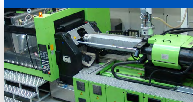
50 ~ 2.000 parts or assemblies