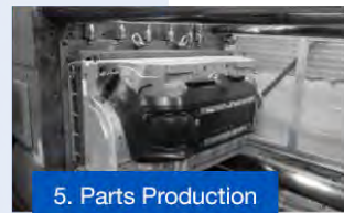
5. Parts Production