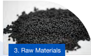
3. Raw Materials