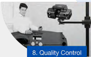
8. Quality Control