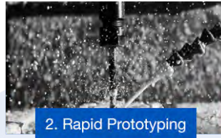
2. Rapid Prototyping